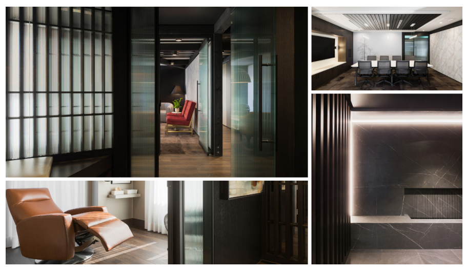
PROJECT The Newly Institute (Calgary, Alta.)

CATEGORY Innovation in Workplace Design